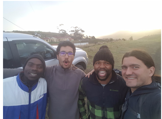
Figure 1 Field visit of two weeks to Mankosi (South Africa)

Additionally, LibreMesh 17.06 Dayboot Rely, the LibreMesh release that will be installed in the LibreRouter it is currently being deployed in the AlterMundi networks to evaluate the stability of its performance, so it is stable by the time the first batch of LibreRouters is produced. Finally, and in order to test the compatibility of the LibreRouter hardware with OpenWRT/LEDE, the LibreMesh team compiled a customized firmware that was successfully tested in the hardware. Note that a core developer from OpenWRT/LEDE is directly involved in this process.